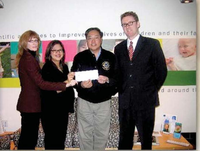
Members attending Community Events