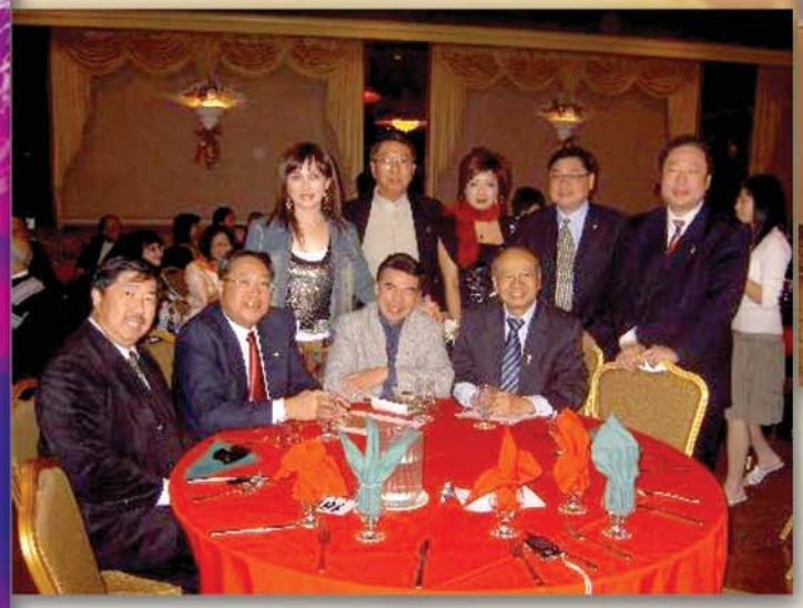
Members attending Christmas Party of Elegant Lions Club